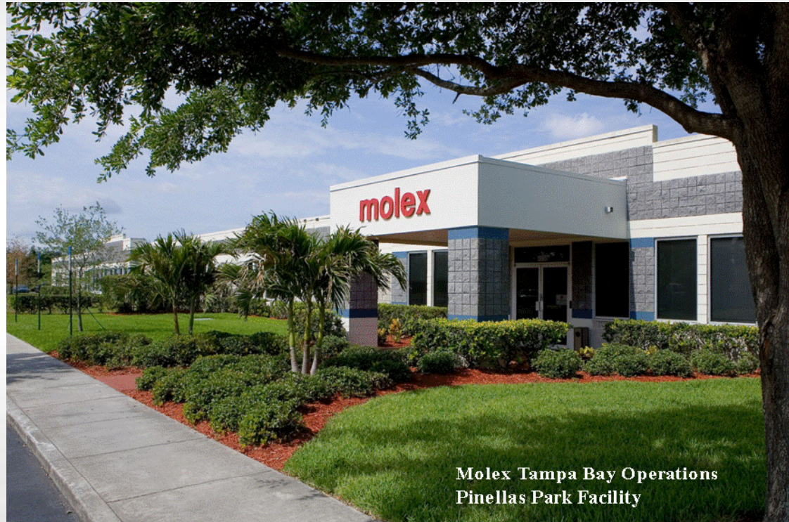
Molex Tampa Bay Operations Pinellas Park Facility

4650 62 nd Ave. North Pinellas Park, FL 33781